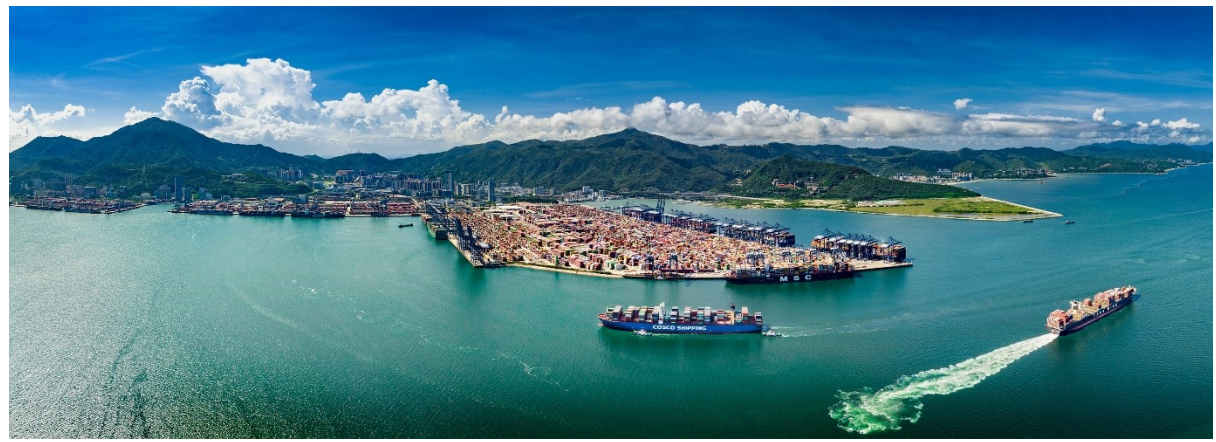
Endowed with advantageous natural conditions, YANTIAN has the unique channel of 18 meters deep and 475 meters wide in the GBA, allowing two-way navigation for 200,000-DWT vessels.